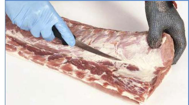
3 Follow the natural seam to remove the eye muscle. Trim eye muscle of excess fat, maximum fat thickness 7 mm.