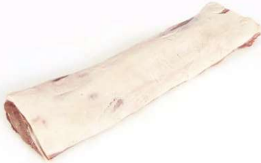
1 Loin of pork – boneless, rindless.