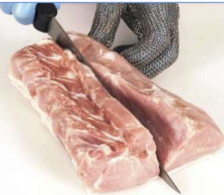
4 Cut eye muscle into required weight portions and cut eye muscle lengthways to create loin cannons.