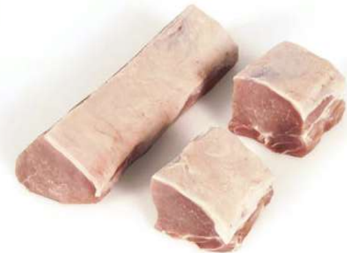
6 Loin Cannon.