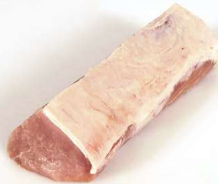
5 Loin Cannon.